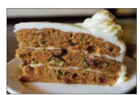
Prolific desserts Page 15